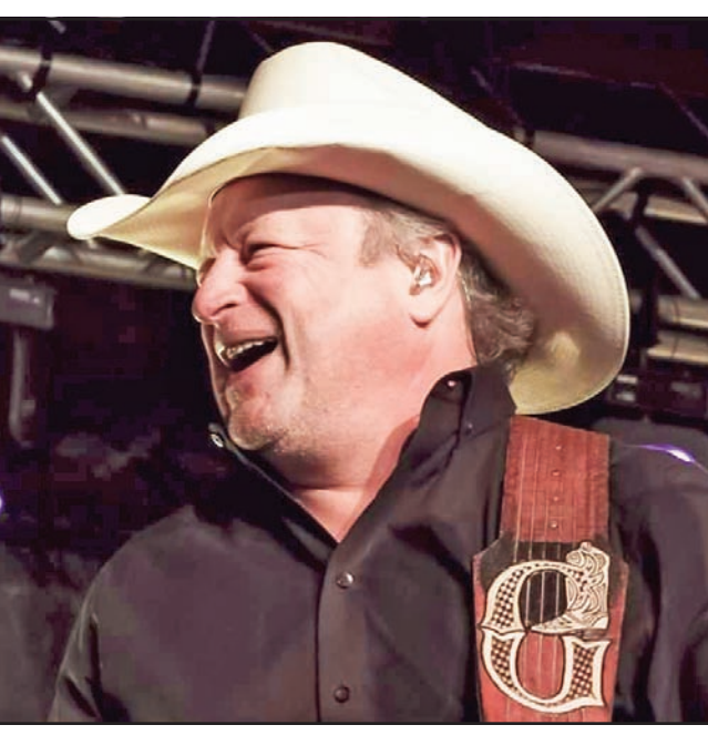
Country Music Star Mark Chesnutt will be performing during the Georgia Mountain Fair on Saturday, Aug. 20, as will fellow music icon Tracy Byrd. Both men have performed for decades and enjoyed many Billboard hits.

including on special deal days for the carnival and a complete